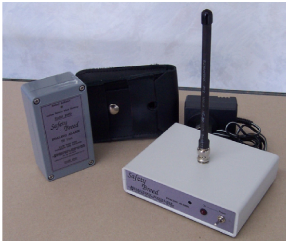
Transmitter / Pouch /Receiver